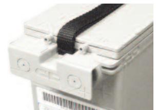
TEL12-155FG with TFA gas collection system