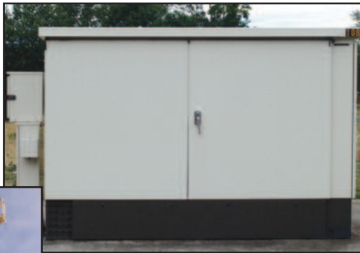
Typical Wireline Application