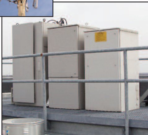
Typical Wireless Application